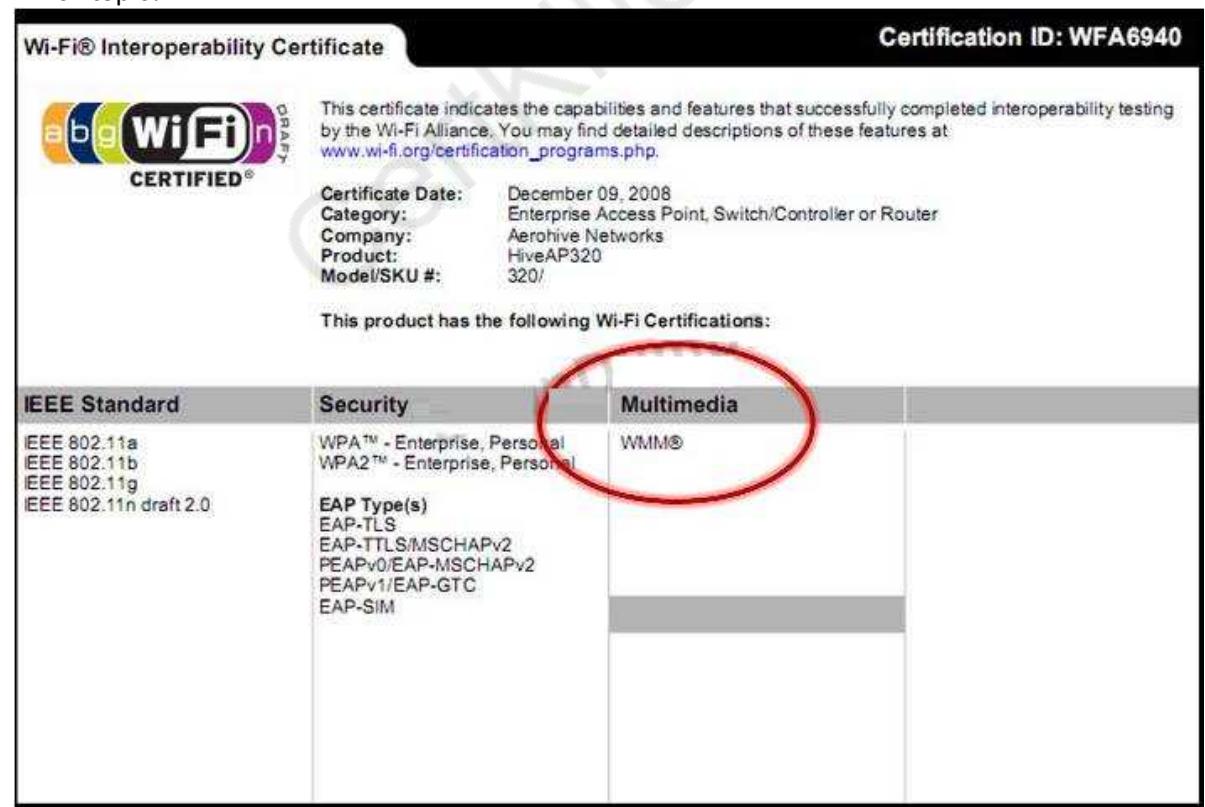
Exhibit: The Wi-Fi Multimedia (WMM) certification, which is illustrated in the exhibit, pertains to which topic?