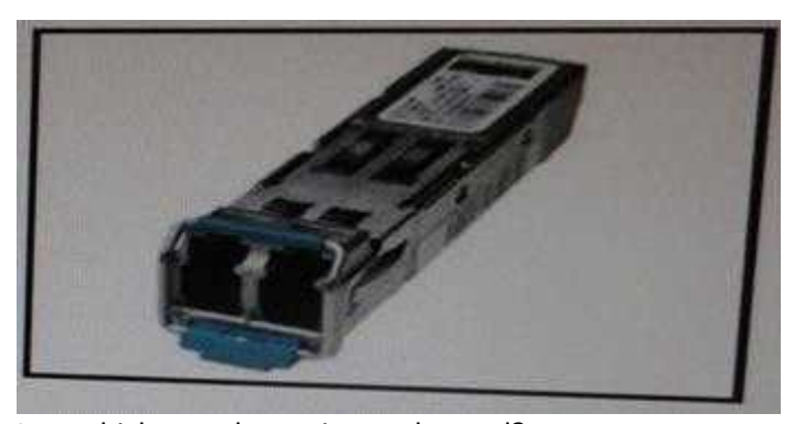
Into which port do you insert the card?